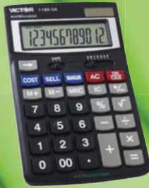
1180-3A Cost/Sell/Margin Keys AntiMicrobial