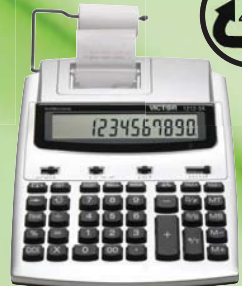
1210-3A, 1212-3A 2.7 LPS 2 Color Printer AntiMicrobial