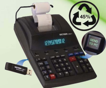
1280-7 4.6 LPS 2 Color Printer Wireless Data Relay