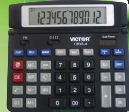
1200-4 Large Tilt Display Auto Replay