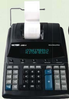
1460-4 4.6 LPS 2 Color Printer 2 Independent Tax Keys