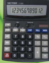
1190 Large Tilt Display Tax +/- Keys