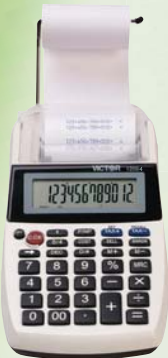
1205-4 2.0 LPS 1 Color Printer AC/DC Power