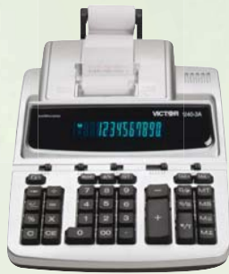
1240-3A 4.3 LPS 2 Color Printer AntiMicrobial