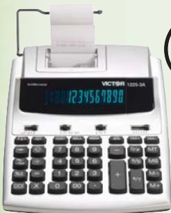
1225-3A 3.0 LPS 2 Color Printer AntiMicrobial