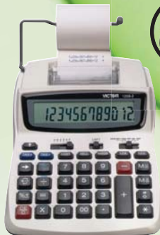
1208-2 2.3 LPS 2 Color Printer AC/DC Power